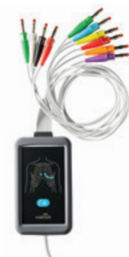
MIDMARK® DIGITAL ECG