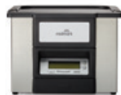
QUICKCLEAN® ULTRASONIC CLEANERS