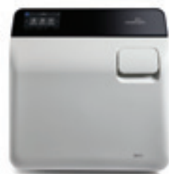
MIDMARK® STEAM STERILIZERS