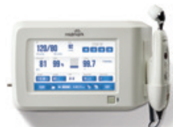
MIDMARK® DIGITAL VITAL SIGNS DEVICE