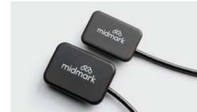
Midmark Intraoral Digital Sensors (sizes 1 and 2)

System Includes: Midmark Intraoral Digital Sensor with either a 3.61-foot (1.1 m) or 9.84-foot (3 m) cable, USB drive with Midmark Imaging Software, sensor calibration file and documentation kit with user manual, sample sheath pack and sensor positioning kit.