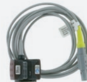
Masimo® Multigas Mainstream CO 2 Sensor and Adapters