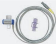
Capnostat® Mainstream CO 2 Probe