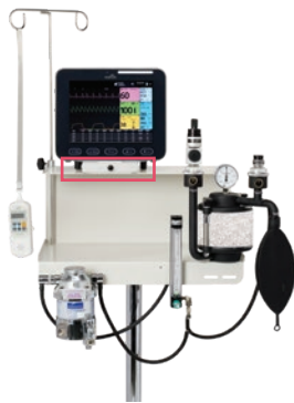
VMS Plus Monitor Mount