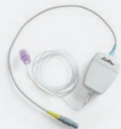
LoFlo™ Sidestream CO 2 Module