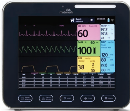
Midmark Multiparameter Monitor 12"