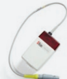
Masimo® Multigas Sidestream CO 2 Sensor and Adapters

Sodasorb LF, Sodasorb, Capnostat, Masimo and LoFlo are all trademarks or registered trademarks of their respective companies.