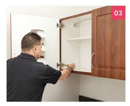
assembly follows bestpractice guideines.

• Midmark Field Project Manager is assigned and on-site for the duration of delivery and installation.