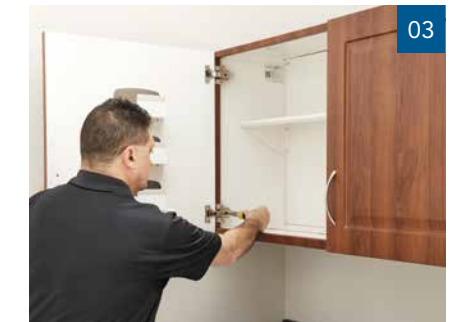
03 Final walk-through and adjustments ensure a fully functional space