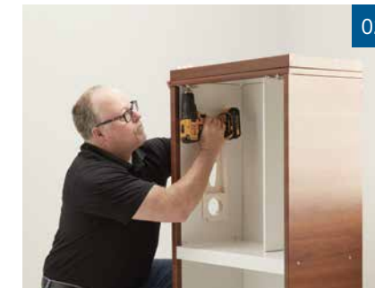
02 Expert product assembly so you get the most out of your cabinetry