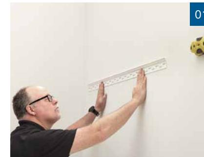
01 Field measurements confirmed to ensure seamless installation